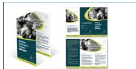
• Leaflets: do they work for your institute?