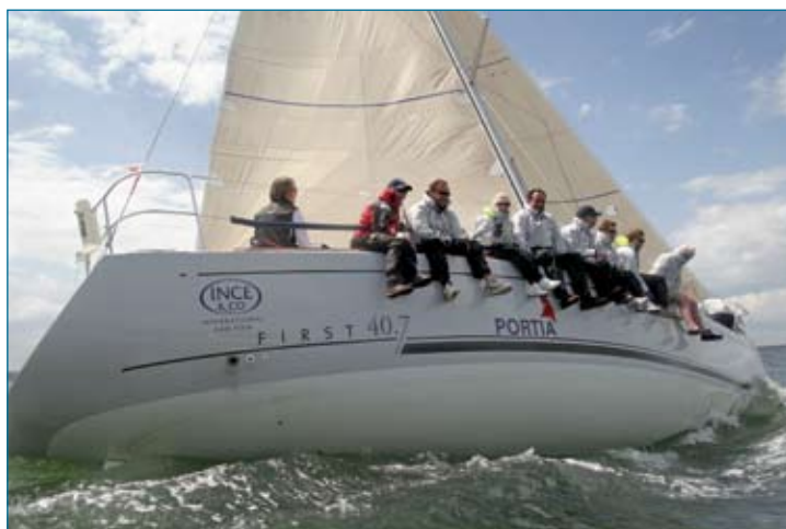
• Ocean Wave: one of the crews in last year's regatta taking a breather.

The regatta is open to crews chartering a yacht and also to companies and individuals with their own yachts who wish to participate as a private entry. The charter division will race on single class of yacht, a fleet of Beneteau 40.7 racer/cruiser yachts with race sails